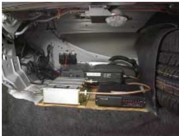
The vehicle repeater system is mounted in the trunk of the car.

Roger's Two Way Radio originally designed this system for law enforcement, but, the vehicle repeater system can be used for almost any radio system. If you have needs for greater range from your portable, contact us for a custom solution. We are here to help.